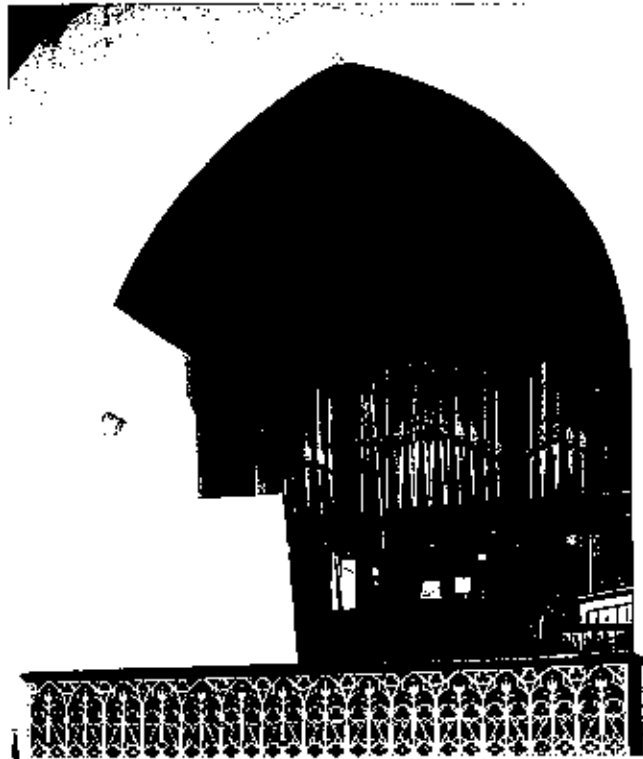
Sleaford United Reformed Church